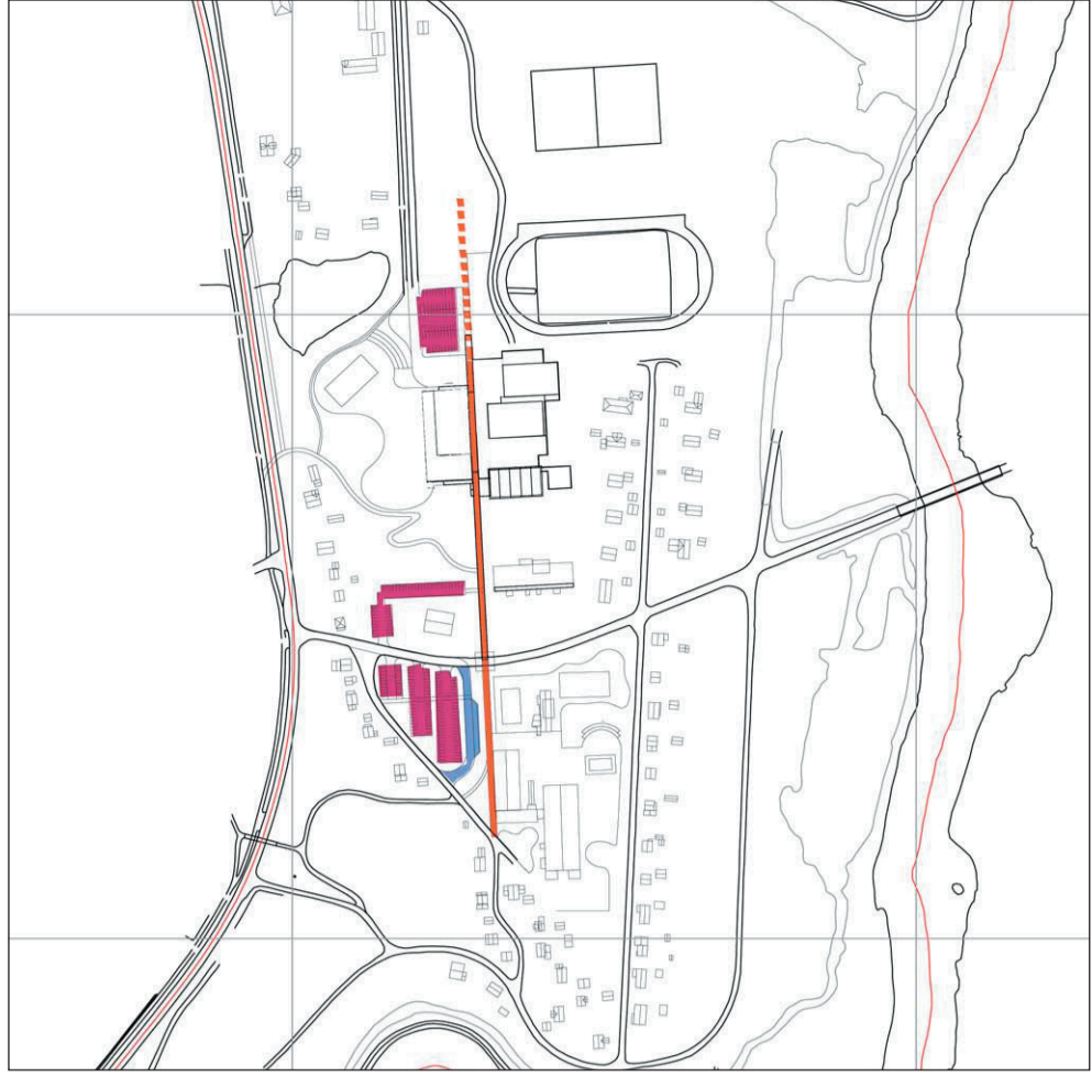
PARKERING - BUSS