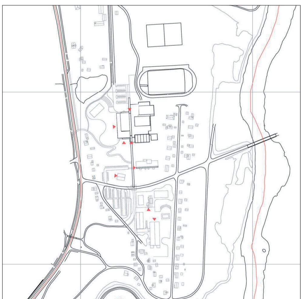
ADKOMST - INNGANGER